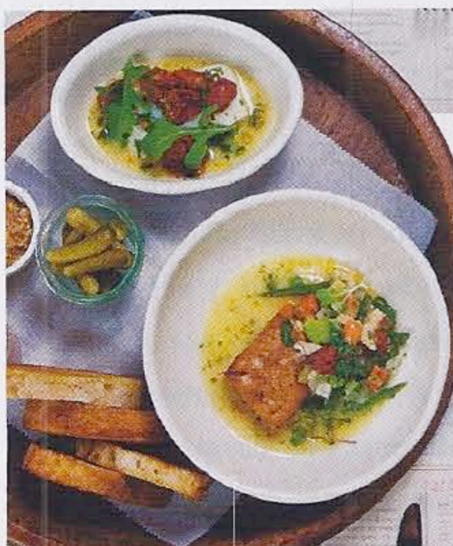
Top: Chef Joshua Hopkins Above: Cod, pork and trip stew

No, we have so many veggie options! We spend a lot of time and a good bit of money on vegetables. We deal with a lot of farmers and source as much local as possible.